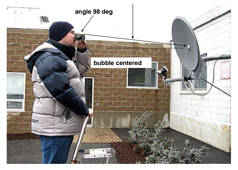
Observe the reflection of the feed in the mirror in the center of the dish