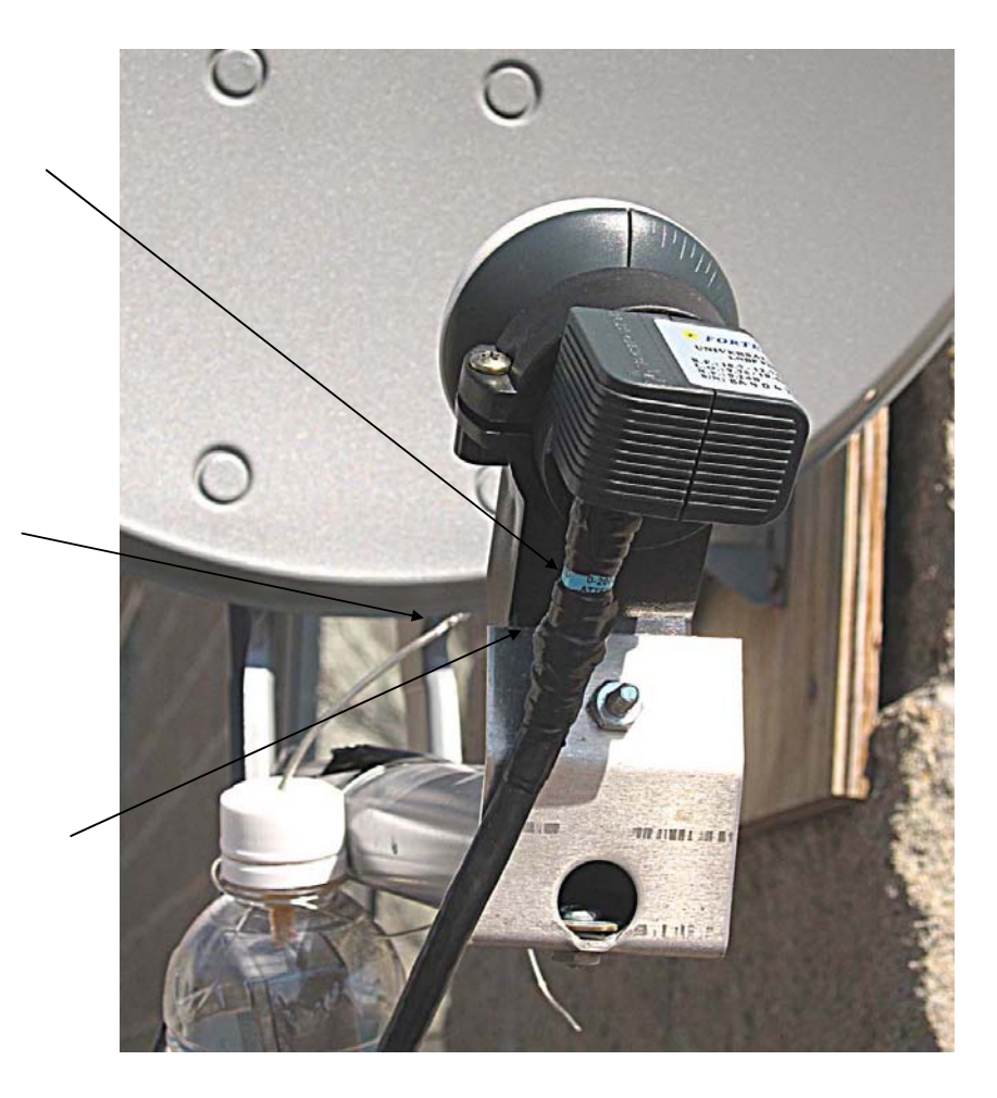
Figure 5b. Detail of calibrator probe.

Be sure to tape over connections to prevent water from entering connector