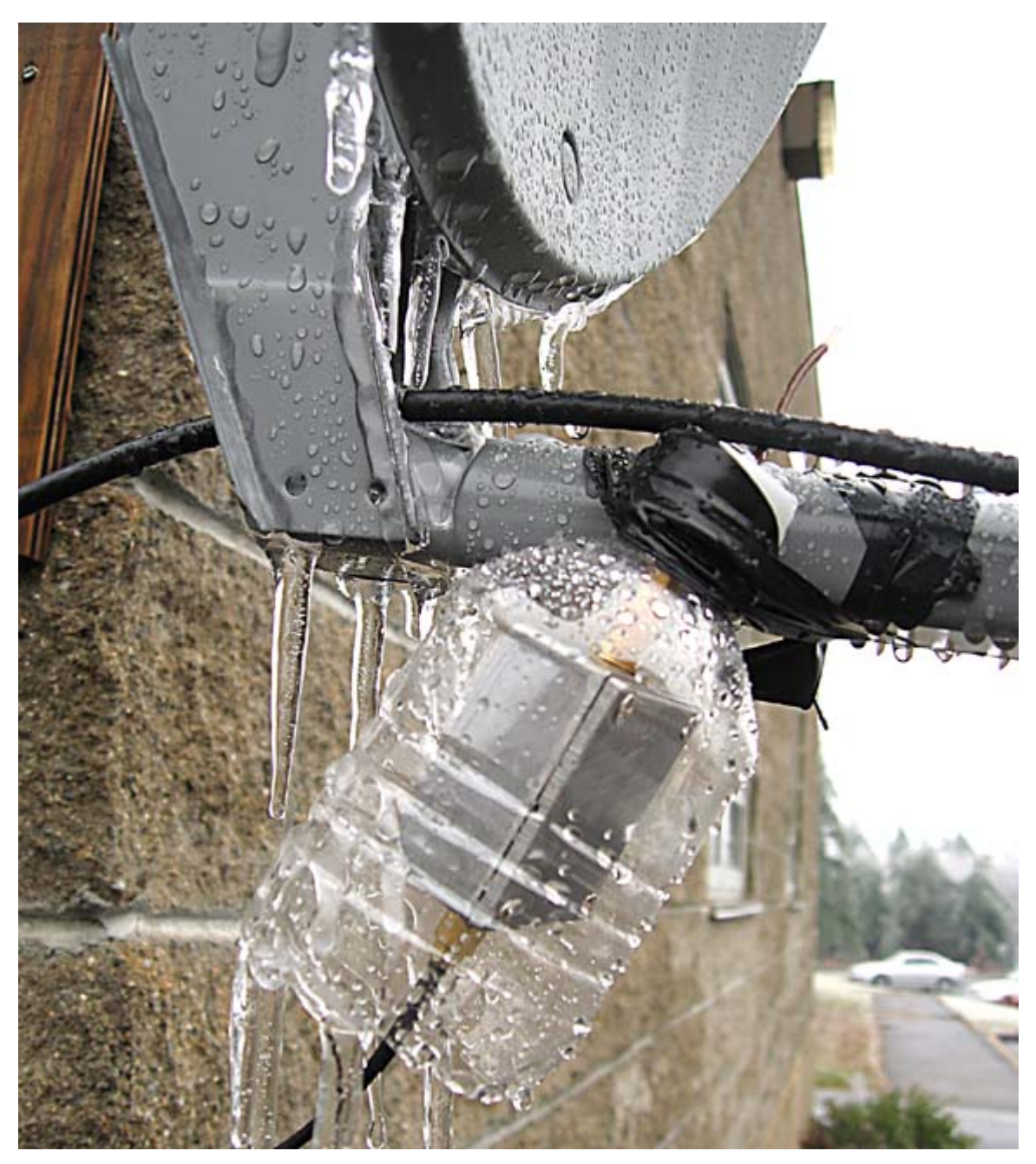
Figure 5a. When correctly assembled the end of the calibrator probe should be at an angle of 45° degrees.