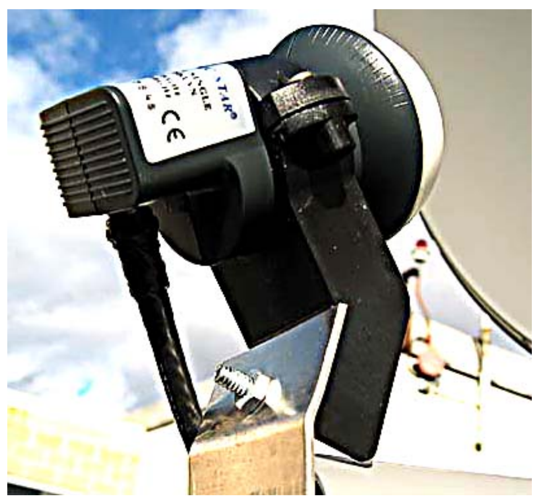
Figure 3. The connector should point down towards the ground and should be well taped to be sure water doesn't get into the connector or the attenuator to which it is attached.