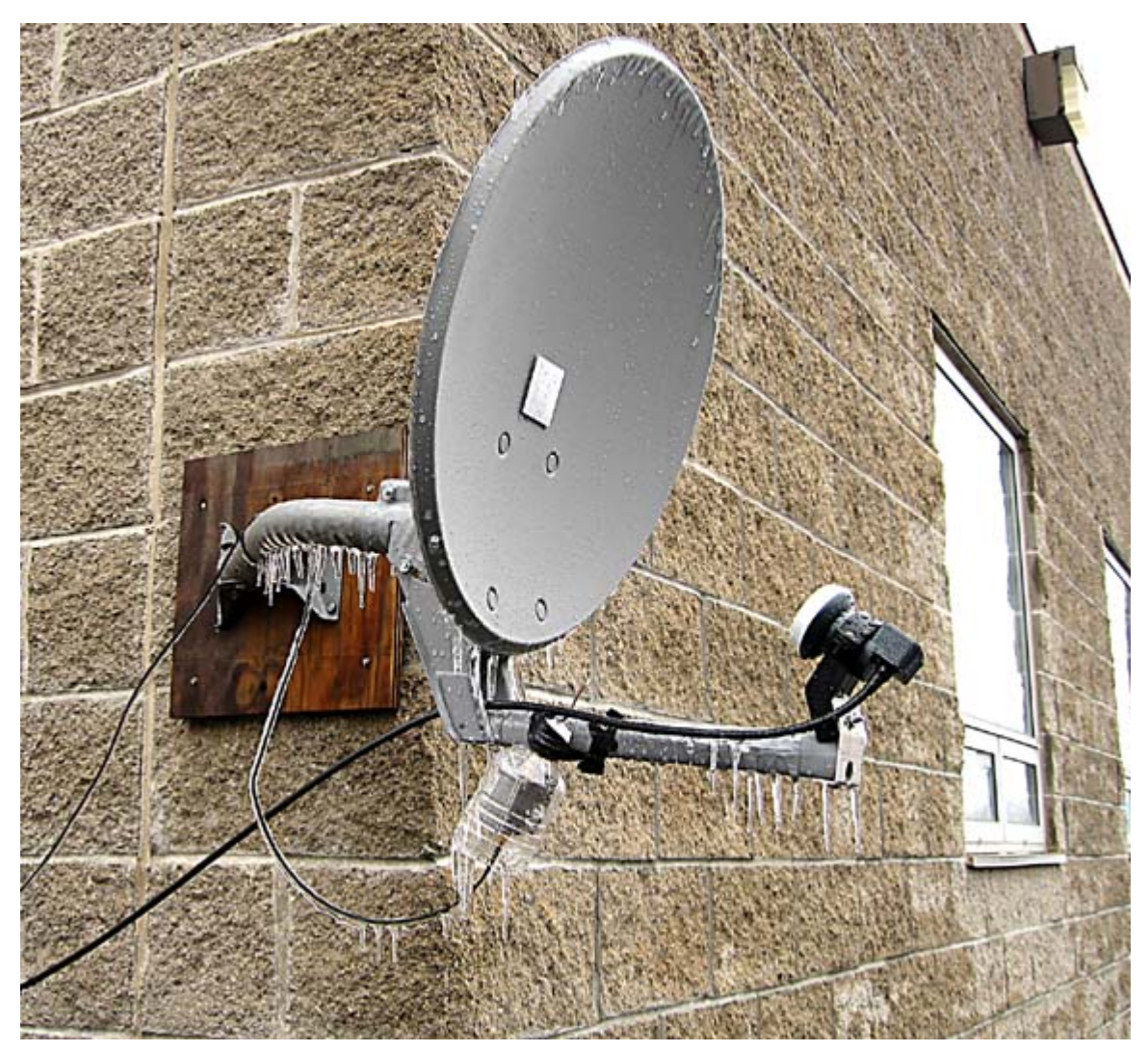
Figure 2. When correctly assembled the LNBF should be 13" (\pm 0.25") from a point 9" up from the bottom edge of the reflector. The LNBF should point towards a point 9" from the bottom of the reflector rather than right at the center. The bottom edge of the front LNBF should be 10" (\pm 0.25") from the bottom of the reflector.