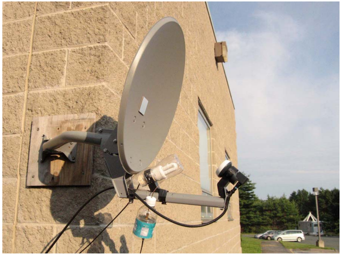
Figure 1. Ozone spectrometer at Haystack with CFL lamp for calibration tests.

Figure 1 show the setup of the ozone spectrometer and the CFL. Initial tests made by Sai Tenneti as part of his REU research used a 12volt 3V CFL (Bright Light SDC-M3W). While these results were promising they were carried in good weather, so that there was