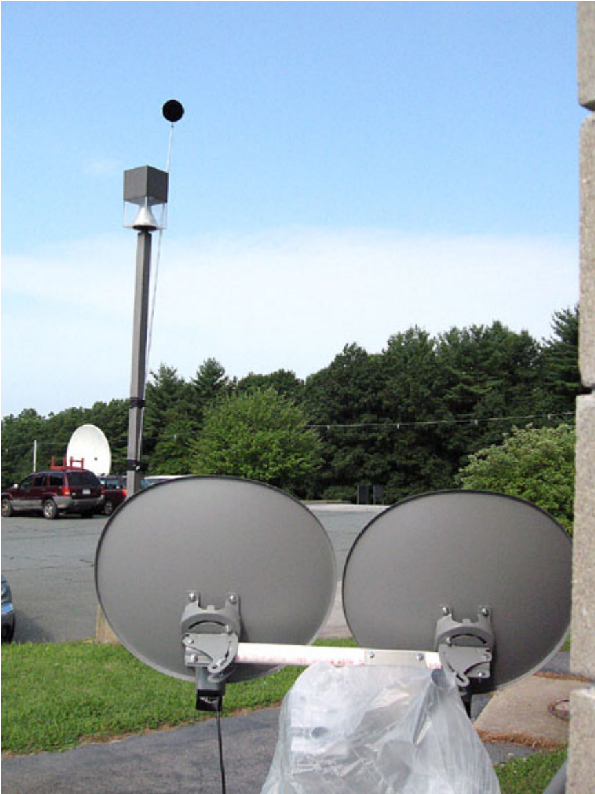
Fig. 1. Vane absorber seen from behind 2-elements interferometer.