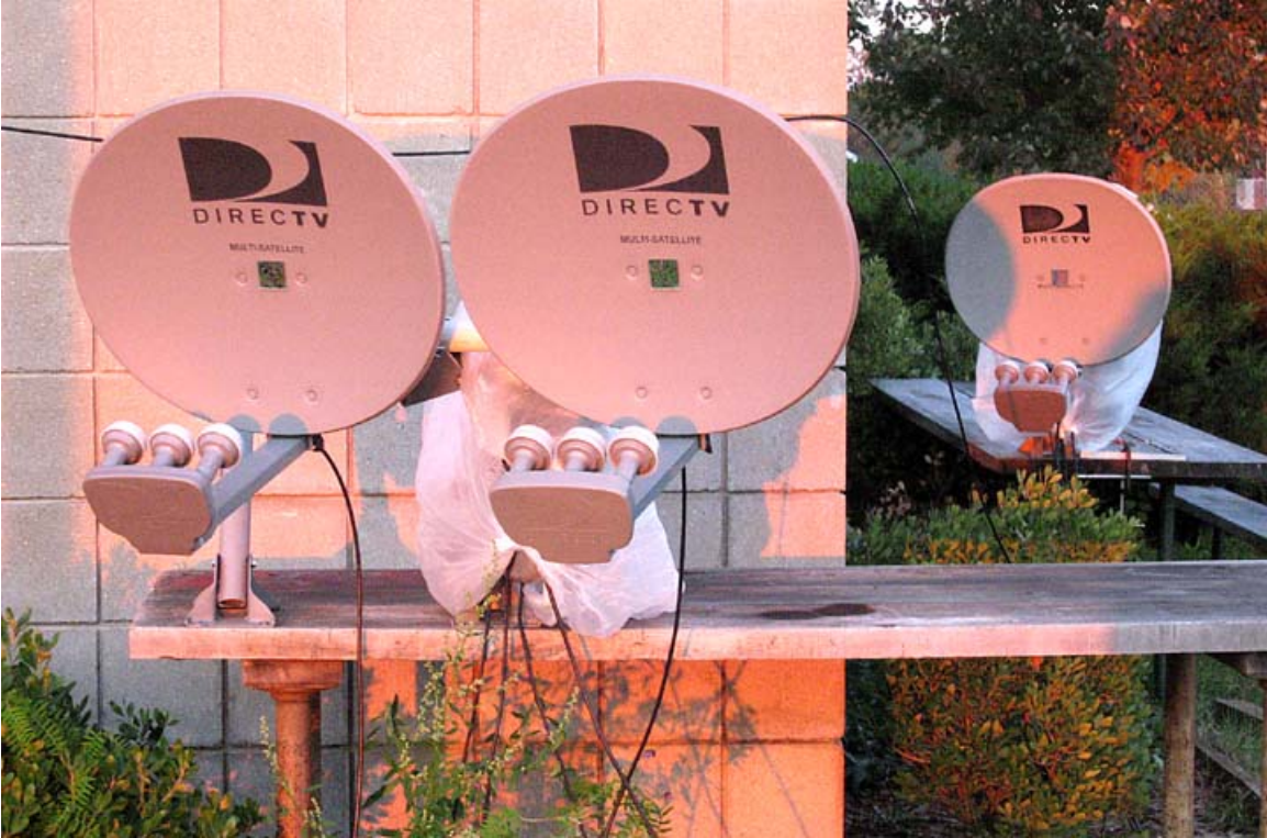
Figure 3 shows the interferometer at sunset on 31 October. The foreshortening on the projected baseline is quite evident. Only the left dish of the 2 dishes in the foreground was used.

significantly reduce the correlation amplitude. With 60 MHz bandwidth the half power points on the delay are at \pm 10 nanoseconds.