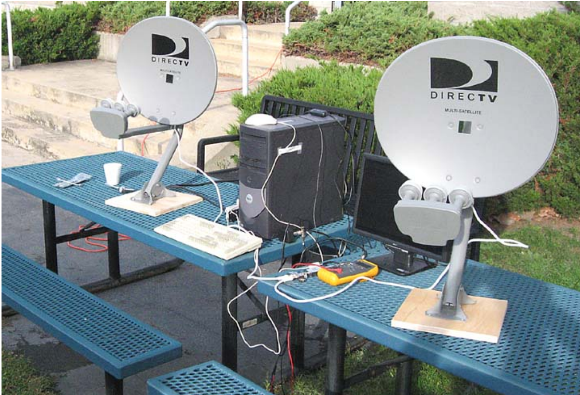
Figure 1. Simple outside set-up to observe the Sun.