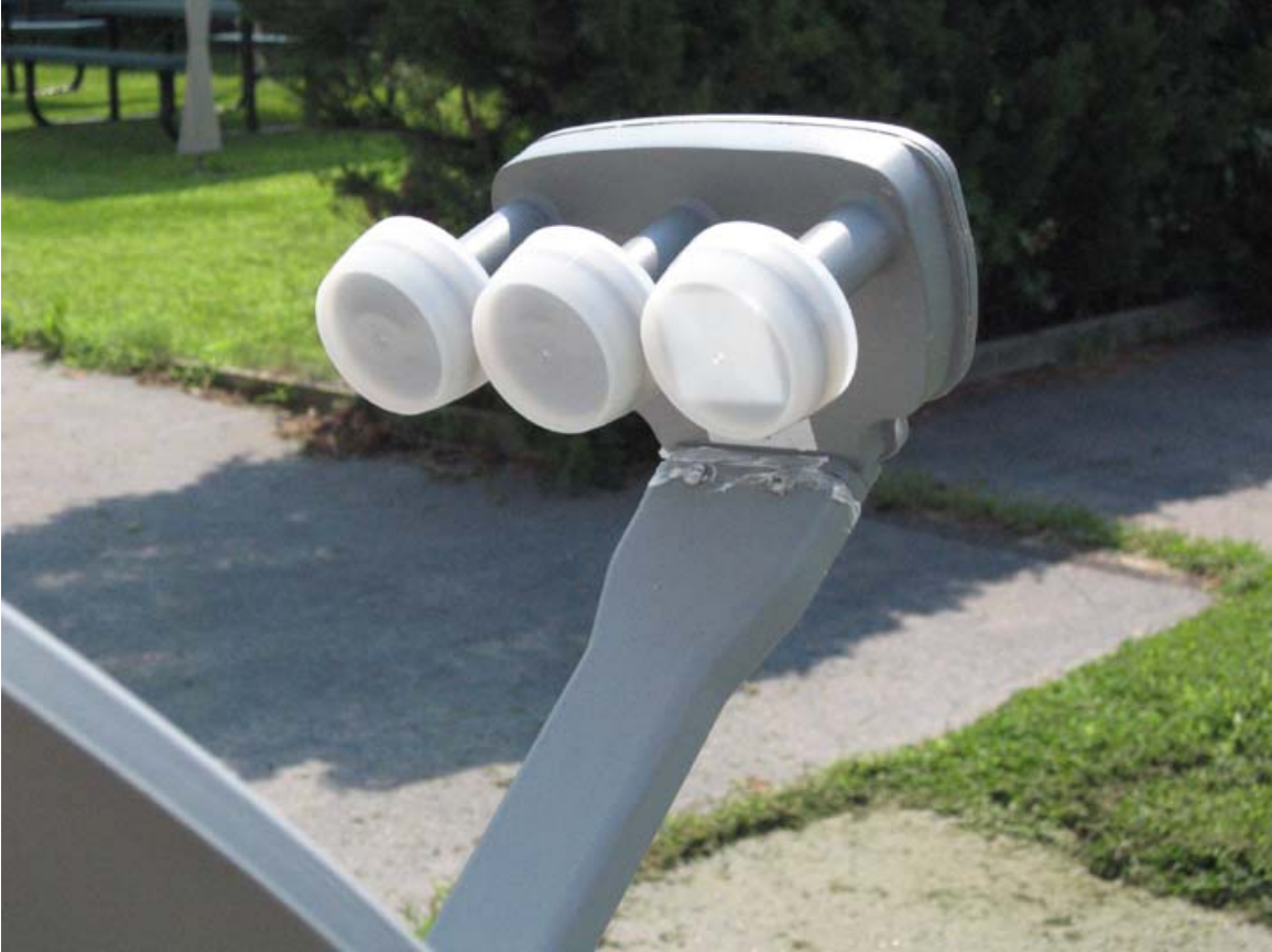
Figure 2. Using reflection of Sun from mirror to point at the Sun.