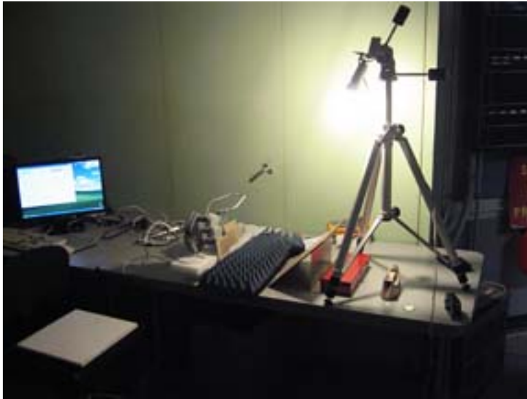
Fig. 4. Setup showing computer screen