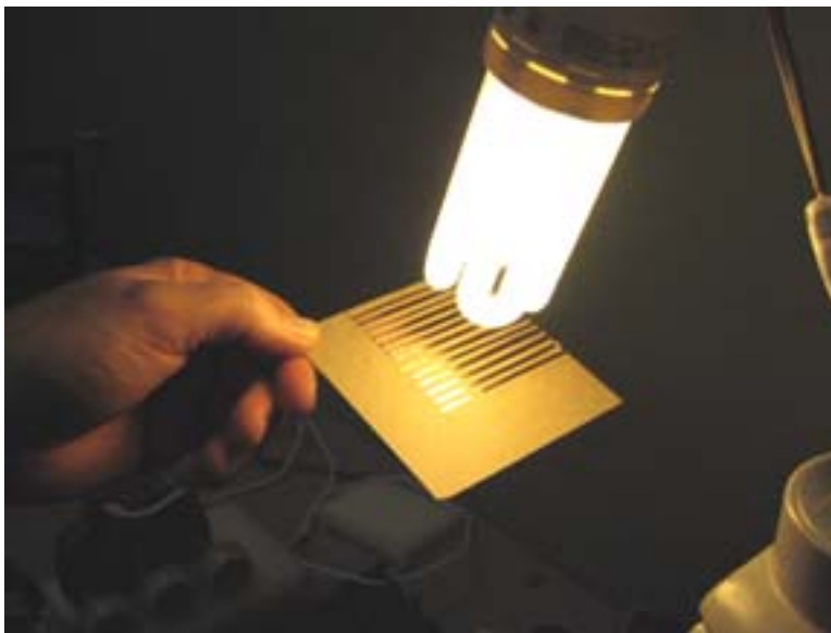
Fig. 5. The polarization can be set either by placing a polarizer over each LNBF or by placing a single polarizer in front of the lamp as shown in this photograph.