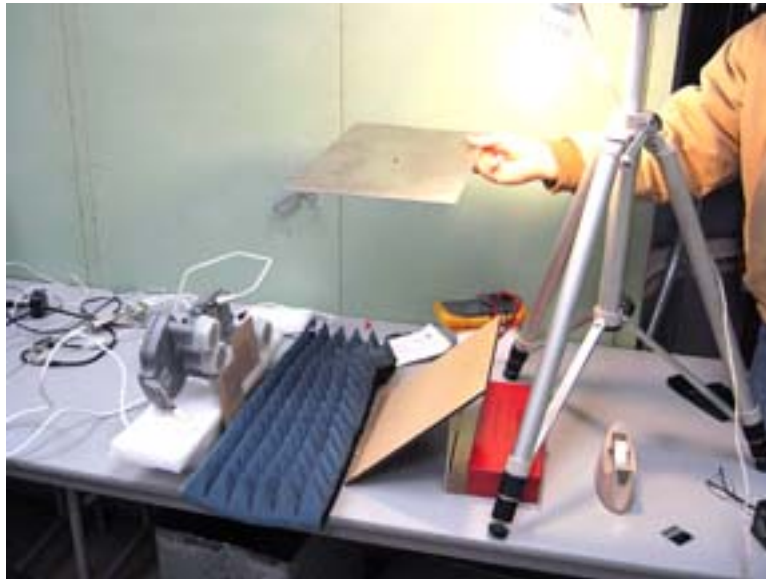
Fig. 3. Photograph of the setup shown schematically in figure 2. If need a metal plate can be used to block any direct radio waves from the lamp to the feeds.