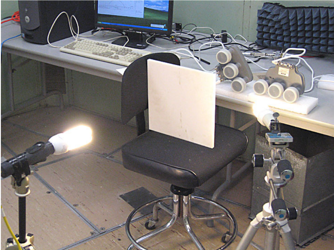
Figure 2. Single baseline interferometer show with dielectric slab in path to one LNBF.