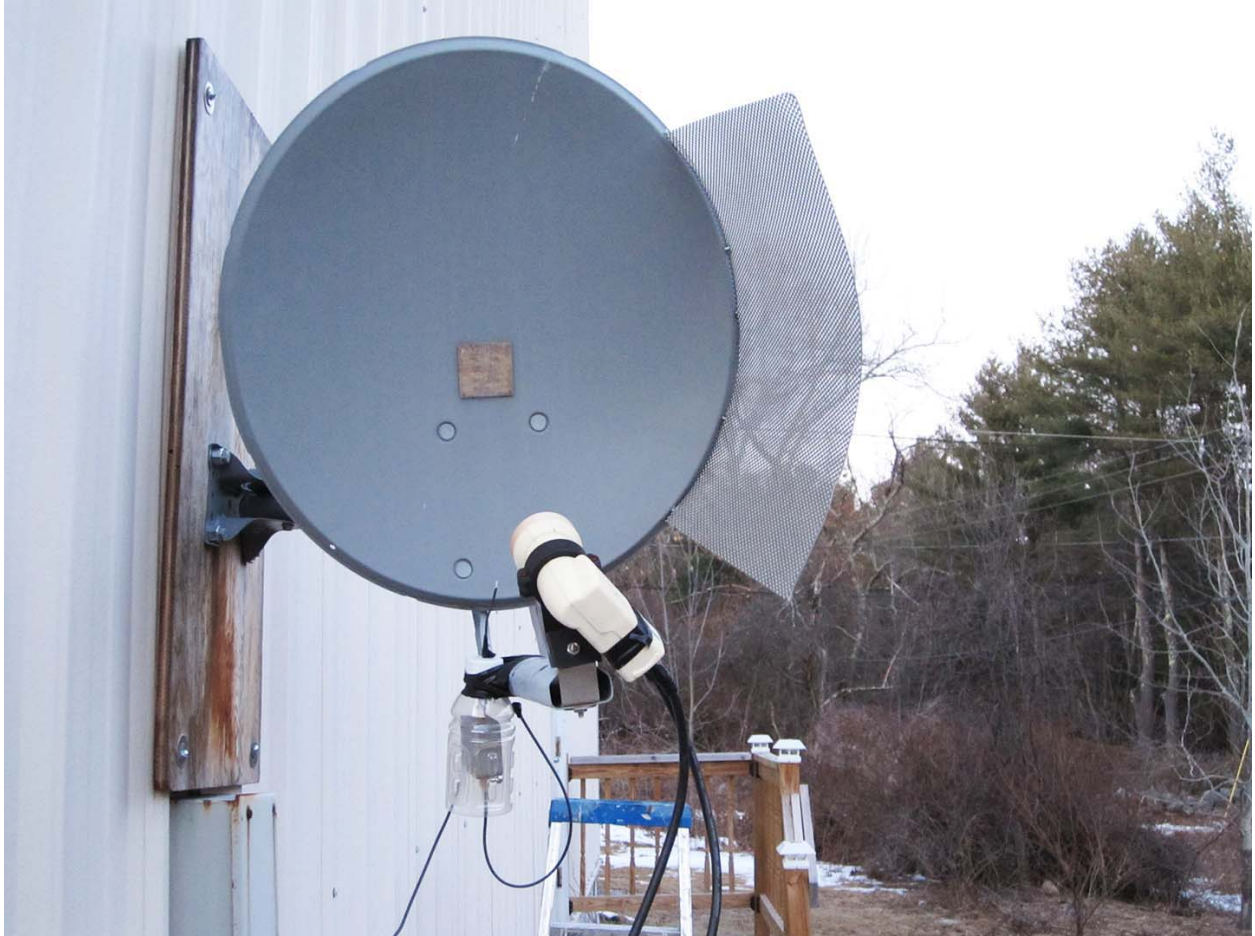
Figure 2. Test shield on east side of dish.