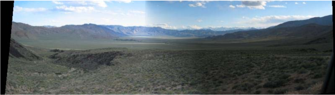
Figure 5- Looking down on Deep Springs, CA, from the northeast.