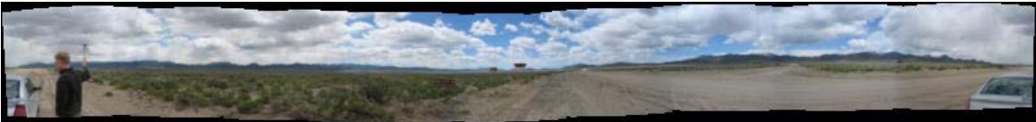
Figure 6 – Panorama from within Monitor Valley, NV.