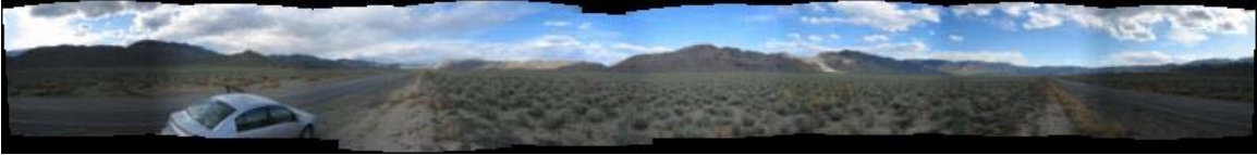
Figure 4 – Panorama from within Deep Springs, CA.