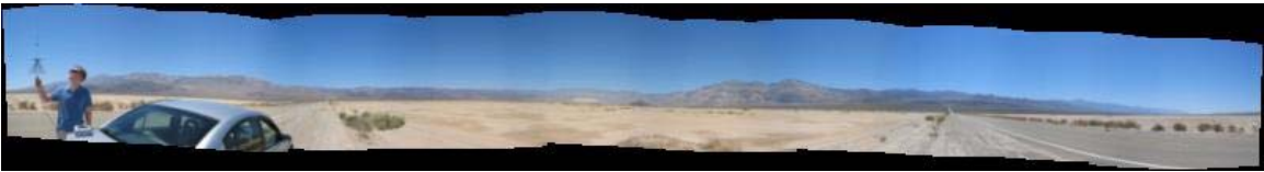
Figure 7 – Panorama from within Panamint Valley, CA.