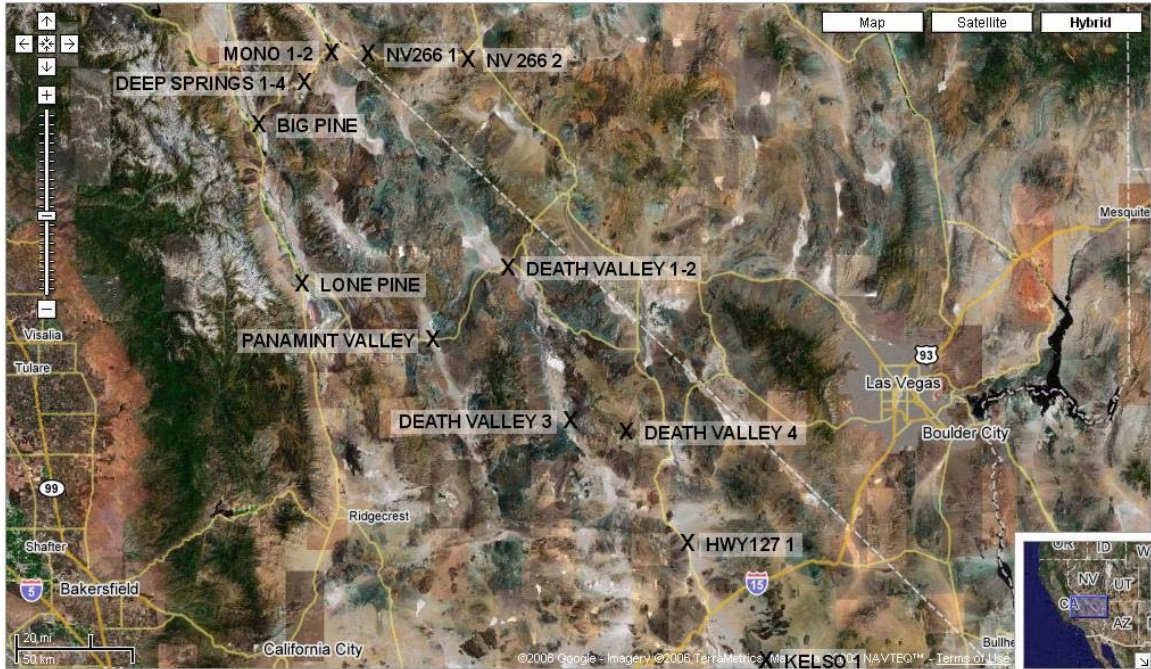
Figure 1 – Map of sites in south-central California.