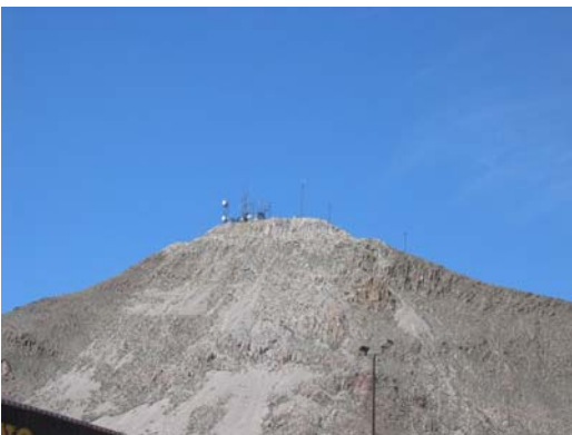
Figure 8 – Repeater stations outside Tonopah, NV