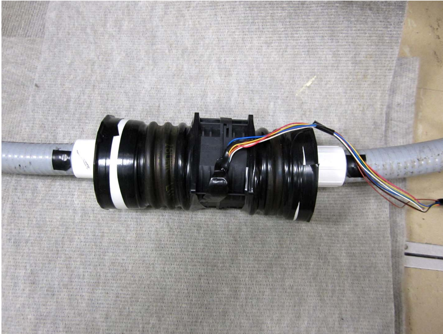
Figure 2. Delta fan air pump with temporary connections to 1 inch flexible pipe.