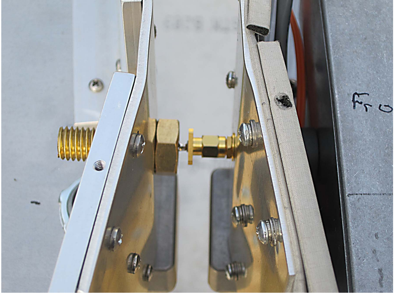
Figure 3. Connection to receiver.