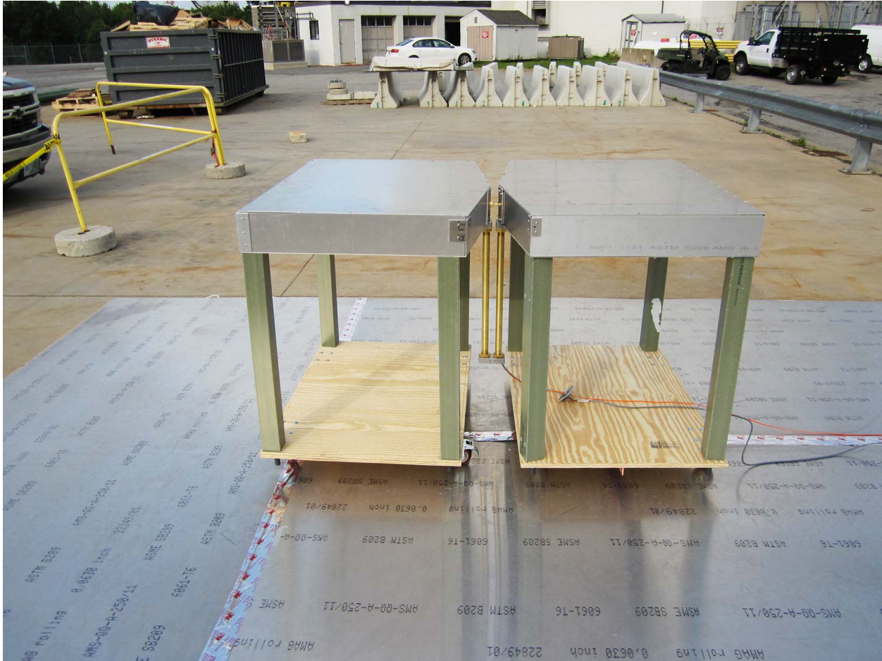
Figure 4. EDGES-3 S11 test at Haystack.